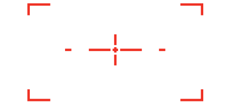
FIGURE 1. LASER AIMER